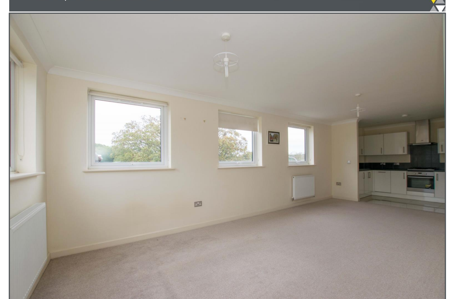
Farningham Road, Crowborough, TN6 2GE